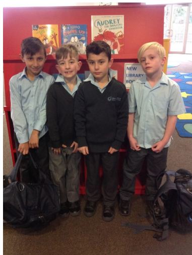
Our Term 2 award winners!